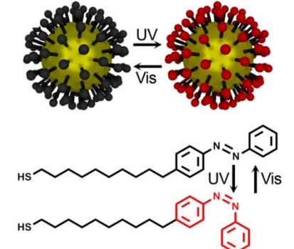
Figure 1. Our system is inspired bv the experiments with photoswitchable Au NPs covered with azobenzeneterminated thiols. Such systems have been shown to

We find that the rate of self-replication does not require constant energy expenditure, but is heavily influenced by the timing of the energy delivery and that periodic energy delivery can increase the rate of self-replication.